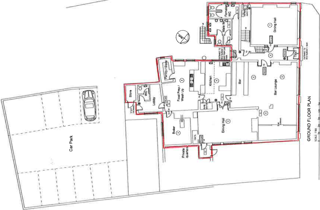
GROUND FLOOR PLAN SCALE: 1:100